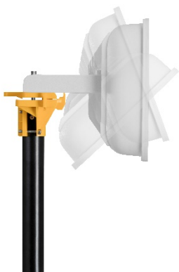
Multi angle head